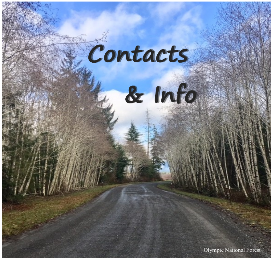
Olympic National Forest