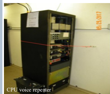
CPU voice repeater